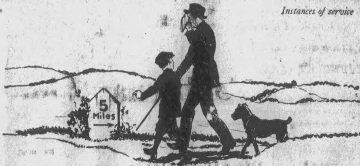
Instances of service