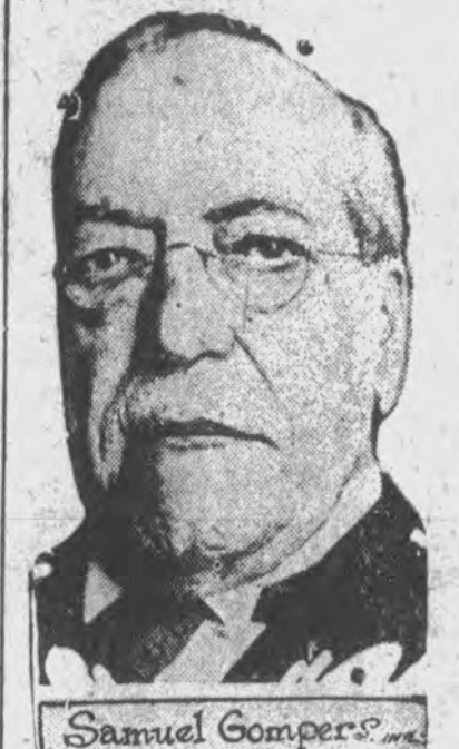
Samuel Gompers, the veteran president of the American Federation of Labor, is recovering from a serious attack of pneumonia at the Lenox Hill Hospital, in New York City.