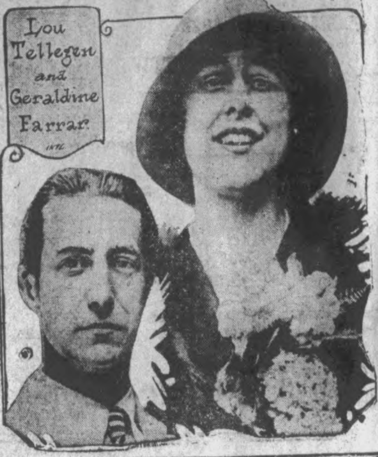
Despite all efforts at secrecy, New York courts have ruled that the trial of the divorce action of Geraldine Farrar, prima donna, against Lou Tellegen, stage star, must be heard in public.