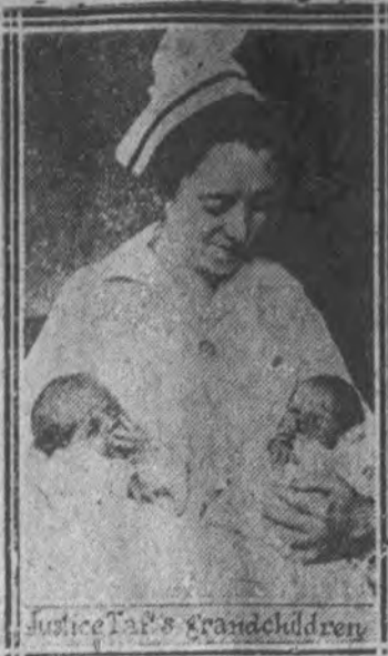
Justice Taft's grandchildren