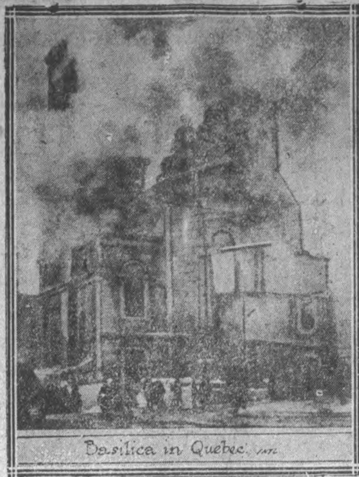
This photograph is of the burning basilica of the Catholic Cathedral at Quebec, Canada, destroyed, with loss of $500,000. Church and civic authorities asserted that members of the Ku Klux Klan are responsible for the incendiary blaze, as well as for numerous others in Catholic institutions in Canada recently.