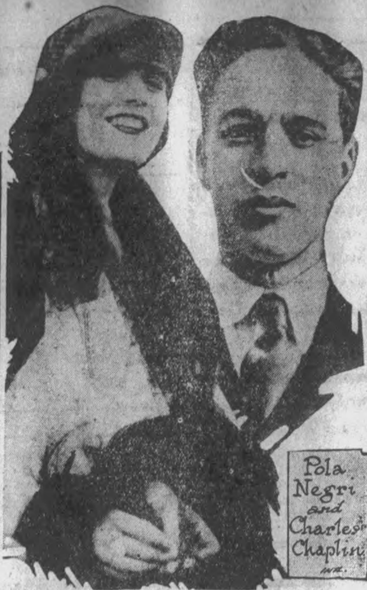
The rumor factory at Hollywood, Cal., is busy talking of the reported engagement of Charlie Chaplin and Pola Negri, famous European screen star, who is making pictures in America. Neither will affirm or deny it.