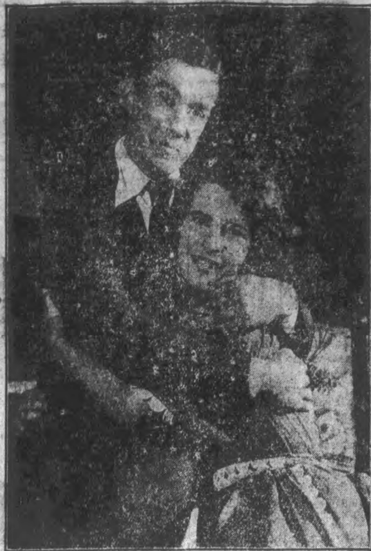
Gregory Kelly and Ruth Gordon in "The First Year," at White's Theatre Monday, Dec. 4th.