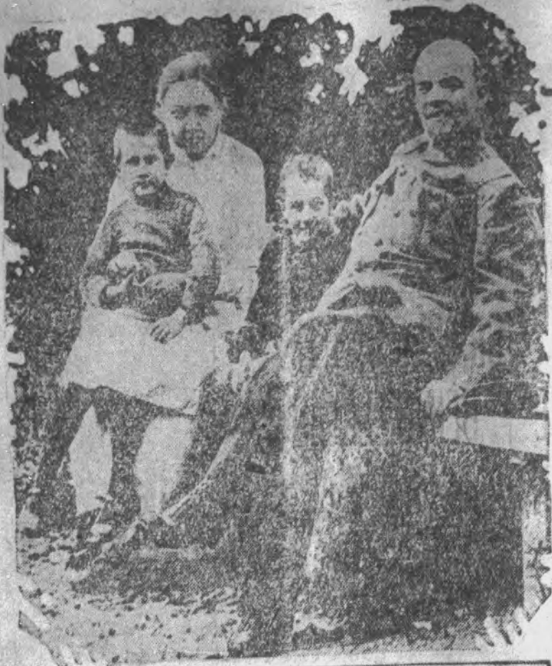
Nicolai Lenin, wife and children in Moscow.

Nicolai Lenin, with his wife and children, is shown in Moscow, where he is recovering from his recent fatal illness.