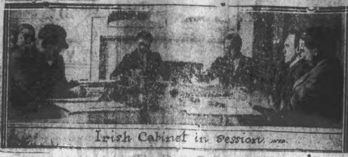
Irish Cabinet in session.

This is the first photograph ever made of the Irish Cabinet of the Free State in official session in Dublin.