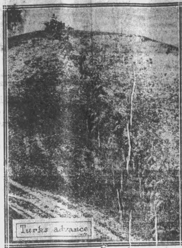
This photograph, taken under fire, shows the Turkish Nationalists troops of Mustapha Kemal, in open order formation, advancing against a Greek rear guard in the hills around Smyrna.