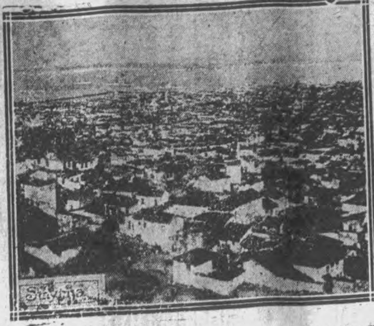
This splendid view shows the City of Smyrna, burned by the Turks under Mustapha Kemal.