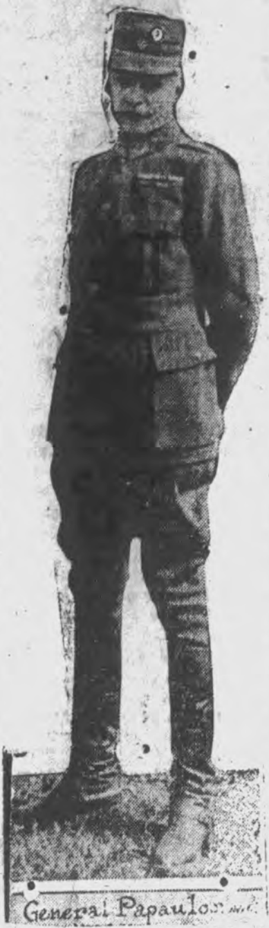
General Papoulos commanded the Greek forces in Asia Minor that have been completely routed by the Turks and driven into the sea.