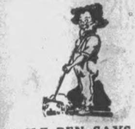
UNCLE BEN SAYS:

"As you go through life Nevvy, don't place all your dependence on wind power. The wise farmer has a gas engine rigged up to do his pumping when the wind won't work."