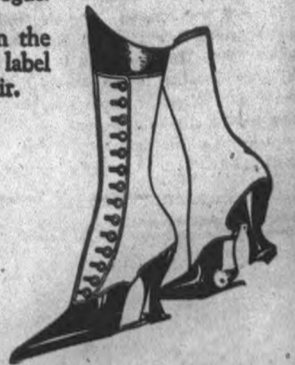
No buckle—will not pull away front or back.

We have it size in the genuine, the Tweedie label sewed inside each pair.