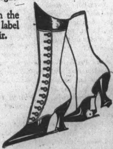
No buckle—will not pull away front or back

We have in the genuine, the Tweedie label sewed inside each pair.