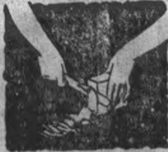
Shave 1/4 bar of Clean Easy Naphtholeine Soap into 4 1/2 gallons of water. Boil until soap is dissolved and put in the clothes.