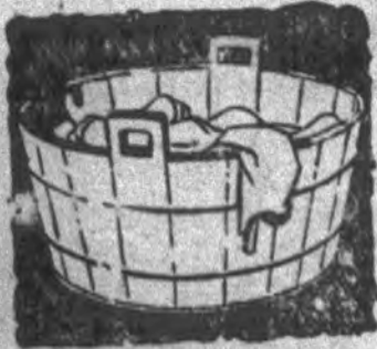
Soak the clothes overnight if possible. If not, simply soak for a while in cold water.