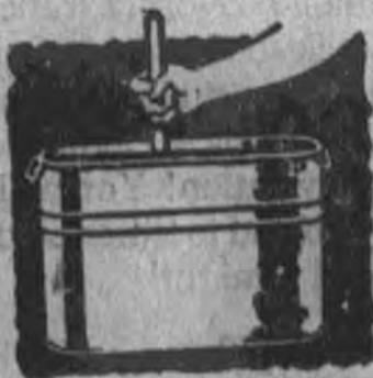
Stir with a stick for ten minutes. Rinse thru two clear waters, blue and dry in open air. Follow directions on inside of wrapper.