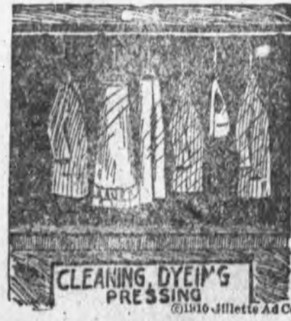
CLEANING, DYEING & PRESSING

We find a facsimile reproduction of Madison's declaration of war against Great Britain which brought on the war of 1812, and his state papers serve as a most illuminating history of the times during that second trial of the young nation's strength. Perry's victory on Lake Erie, the heroic death of Lawrence, the burning of the capitol and all other public buildings at Washington, the Hartford convention, which gave expression to a large number of disaffected New Englanders; the remarkable fact that a hard fought, decisive battle took place at New Orleans under the direction of General Jack