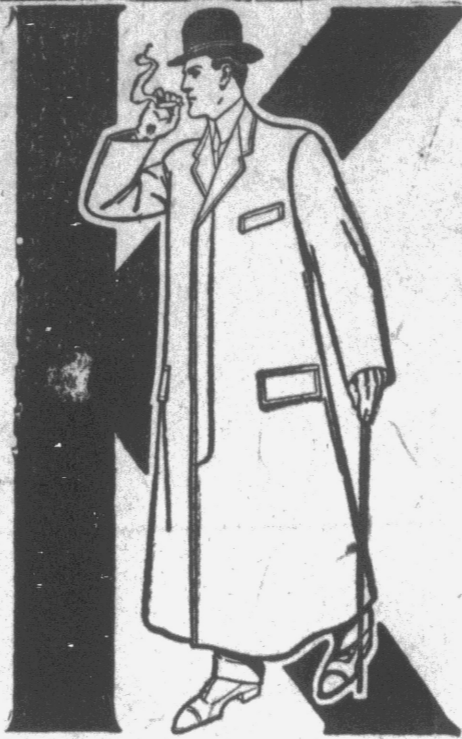
The Kenreign, A Guaranteed Raincoat

From The most inexpensive Suit or Overgarment to the costliest production on our Clothing counters, they are better values than obtainable elsewhere. The same care is taken to give our customers the best. There is not the equal of suits or Overcoats in Pitt county. It will pay you a short while to look over this line of Clothing. It means more style for you and values you don't find elsewhere.