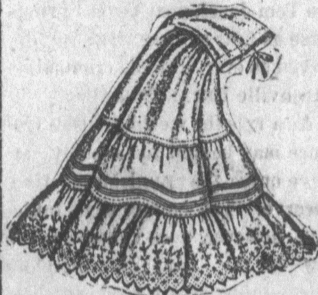
Muslin Skirt, Tucked and Trimmed with Tucked Cambric Flounce. 24c