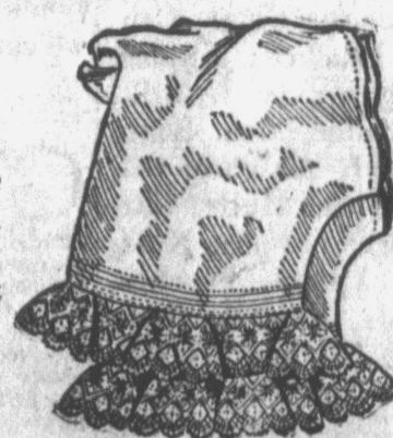
Muslin Drawers, Umbrella. Three clusters of tucks. Ruffle of Hamburg edge. 49c