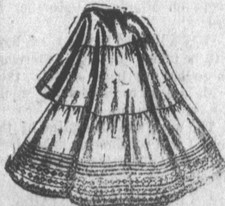
Muslin Skirt, Three Tucks and Wide Hem. 29c