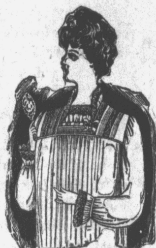
Muslin Gown, yoke of Swiss Embroidery, Insertion and Ribbon through Ribbon Beading. Lawn ruffle trimmed with Swiss Embroidery on neck and sleeves. 98c