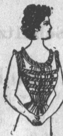
V-Neck Corset Cover, trimmed with Hamburg Insertion between hemstitched top and hemstitched Lawn ruffle. 39c