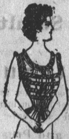
V-Neck Corset Cover, trimmed with Hamburg Insertion between hemstitched tucks and hemstitched Lawn ruffle. 39c