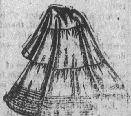
Muslin Skirt, Three Tucks and Wide Hem. 29c