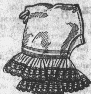
Cambric Umbrella Drawers, deep flounce, trimmed with two rows Torchon Insertion and edged with Lace. 98c