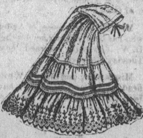
Muslin Skirt, Tucked and Trimmed with Tucked Cambric Flounce. 94c