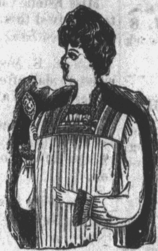
Muslin Gown, yoke of Swiss Embroidery, Insertion and Ribbon through Ribbon Beading. Lawn ruffle trimmed with Swiss Embroidery on neck and sleeves. 98c