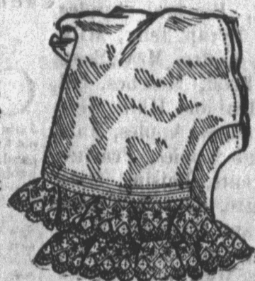
Muslin Drawers, Umbrella. Three clusters of tucks. Ruffle of Hamburg edge. 49c