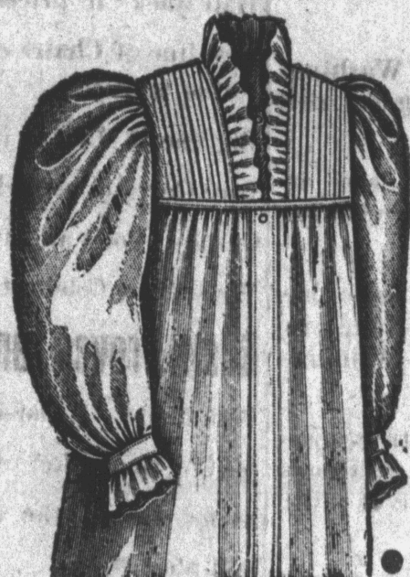
Muslin Gown, square neck. Yoke trimmed with Hamburg Insertion and alternate sized tucks. Neck and sleeves trimmed with Cambric ruffles. 39c

Just back from New York. Everything bright and new and up-to-date.