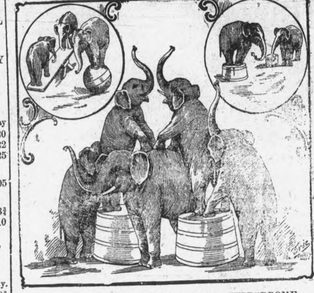
MAMMOTH MENAGERIE AND REAL HIPPODROME.

"The Rhoda Royal Shows was good, big and moral."—Worcester Spy, August 29, 1900.