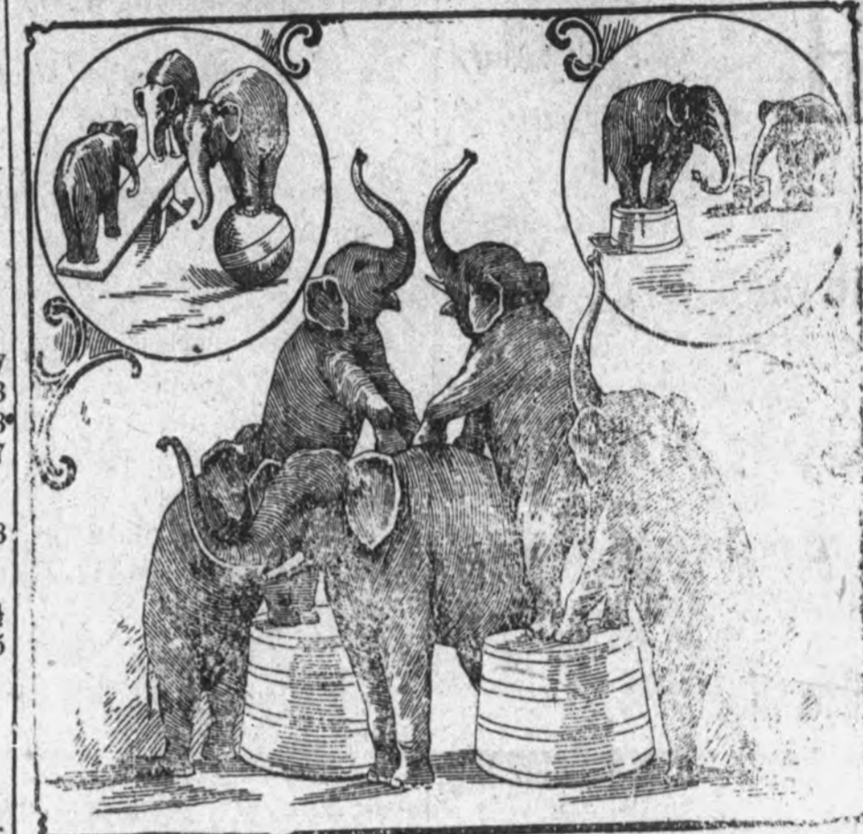
MAMMOTH MENAGERIE AND REAL HIPPODROME.

"The Rhoda Royal Shows was good, big and moral."—Worcester Spy, August 29, 1900.