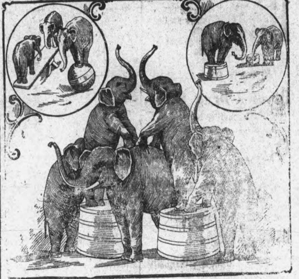
MAMMOTH MENAGERIE AND REAL HIPPODROME.

"The Rhoda Royal Shows was good, big and moral."—Worcester Spy, August 29, 1900.