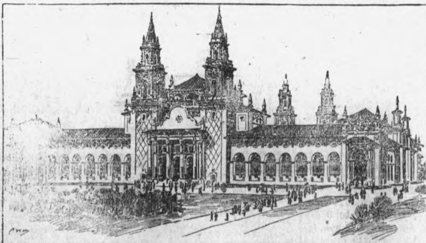
The building's structure is 500 by 350 feet, with a central court 100 by 175 feet. Its type of architecture is the Spanish Renaissance, modified to suit the conditions of the Exposition. The roofs are laid with red tile and the cemented walls are brilliant with color. The colors are to be reds and yellows in light tints. The facades will present an arched effect, with broad, overhanging eaves, in imitation of the old mission buildings in California and Mexico. The Central Court will be a veritable tropical garden, with a long, narrow pool, containing interesting specimens of aquatic life, and will have seats, where the weary visitor may rest a moment. The Exposition is to be held in Buffalo in 1901 from May 1 to Nov. 1.