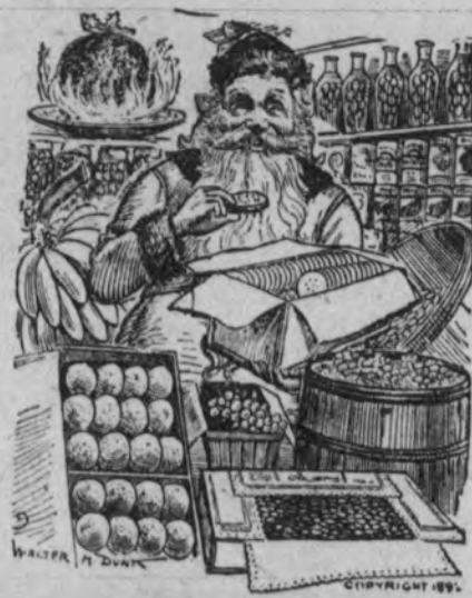
ENJOYING AN XMAS FEAST

is what everyone in Greenville is looking forward to in the season of good fellowship and merriment, and right here at our store will be found all the delicious morsels in cakes and candies, choice fruits, celery, cranberries, fancy oranges and apples, nuts, raisins and everything else you can think of. For your Christmas baking we have the finest pastry flour, flavoring extracts pure spices as well as pickles and jellies at bed rock prices.