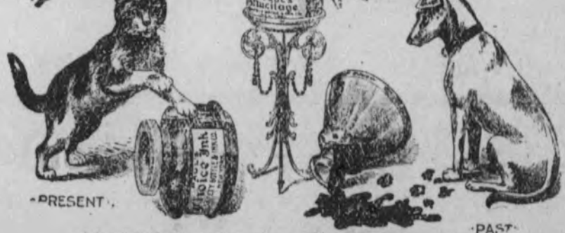
Automatic Ink Stand that will not spill when upset. Absolutely non-evaporating.

THE MOST IMPORTANT INVENTION IN THIS LINE EVER ACCOMPLISHED.