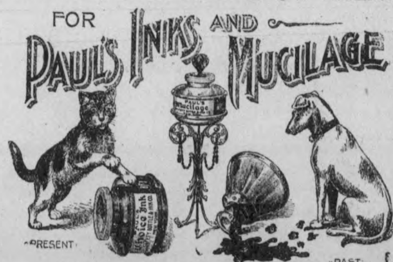
Automatic Ink Stand that will not spill when upset. Absolutely non-evaporating.

THE MOST IMPORTANT INVENTION IN THIS LINE EVER ACCOMPLISHED.