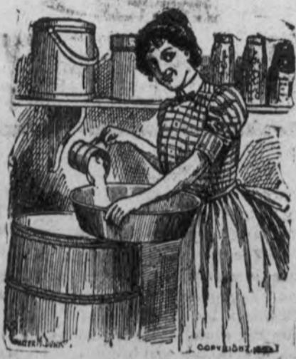
THE FAMOUS FLOUR BARREL

is the source of much culinary enjoyment in white and delicious breads, rolls, cakes, pastry, biscuit etc., if it contains our high grade Snow Drift flour. If your flour supply needs replenishing try this choice brand. We have a full line of the very best family groceries.