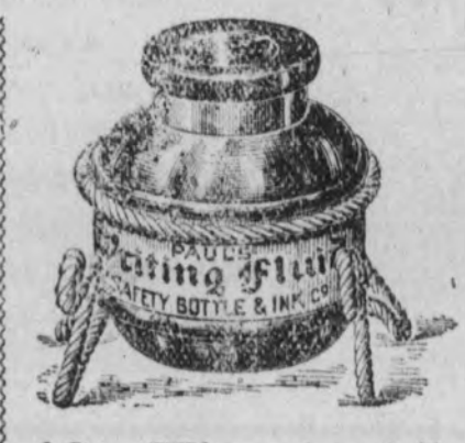
10 c Wire stand 5c