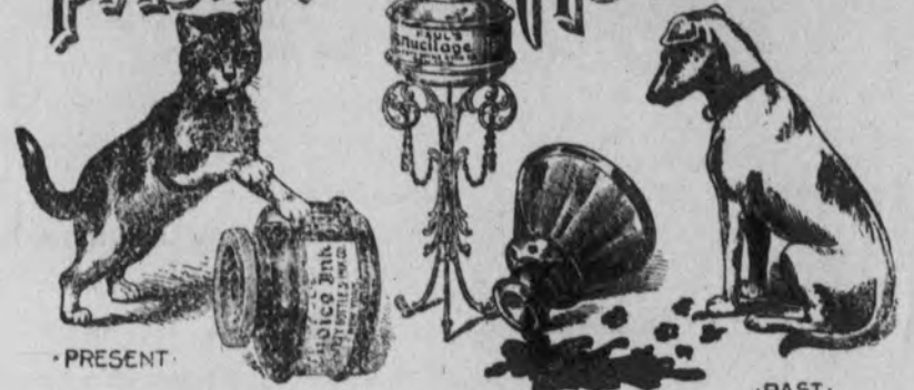
Automatic Ink Stand that will not spill when upset. Absolutely non-evaporating.

THE MOST IMPORTANT INVENTION IN THIS LINE EVER ACCOMPLISHED.