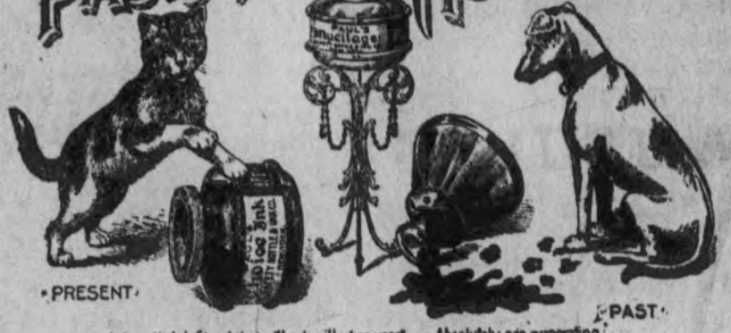
Automatic Ink Stand that will not spill when upset. Absolutely non-evaporating. THE MOST IMPORTANT INVENTION IN THIS LINE EVER ACCOMPLISHED.