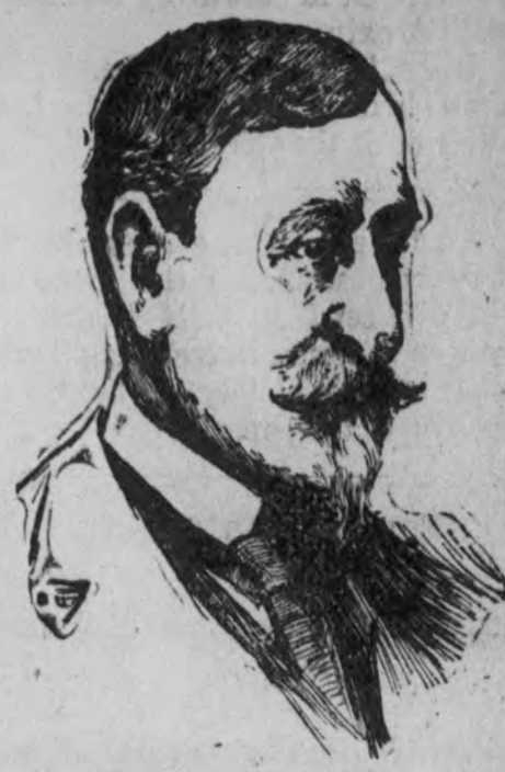
COMMODORE W. S. SCHLEY.