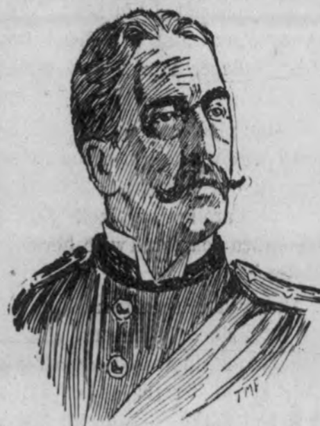
MAJOR-GENERAL NELSON A. MILES.