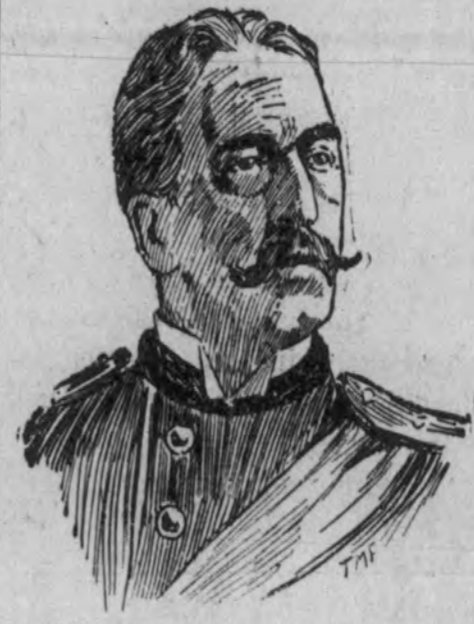
MAJOR-GENERAL NELSON A. MILES.