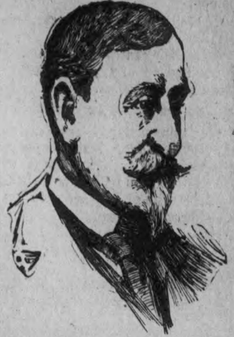
COMMODORE W. S. SCHLEY.