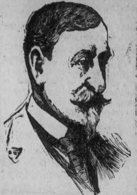
COMMODORE W. S. SCHLEY.