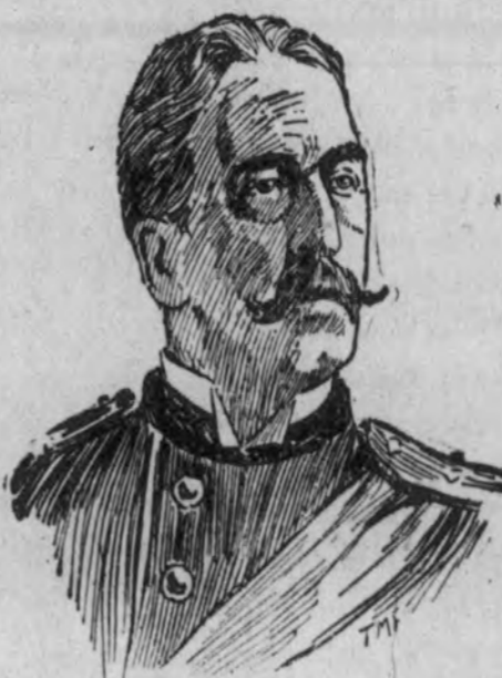
MAJOR-GENERAL NELSON A. MILES.