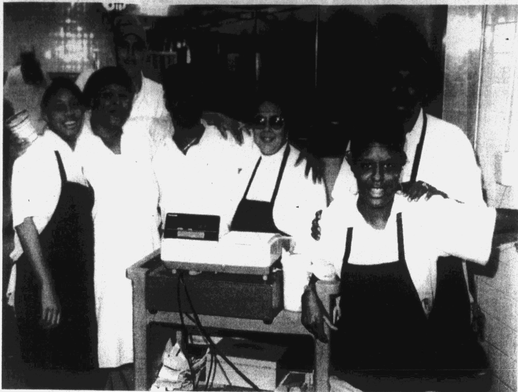
HAPPY FACES AT PARKERS BARBECUE NO. 1 —If you would like to pick up an "M" Voice Newspaper, these beautiful faces at Parker No. 1 invite you to drop by for some good old fried chicken or barbecue, and pick up your "M" Voice Newspaper so you can eat and read.