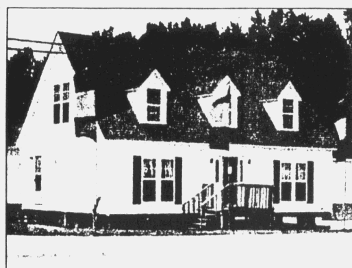
1800 Sq. Ft. Cape Cod

If you decide to purchase additional treatment, you have the legal right to change your mind within three days and receive a refund.