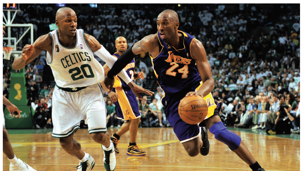
Kobe Bryant, right, during Game One of the 2008 NBA Finals in Boston, Ma., on June 5, 2008.

Wednesday night, during East Carolina University men's basketball team's matchup with the University of Houston, the Minges Maniacs set up a sign for fans to write messages. After signed, it