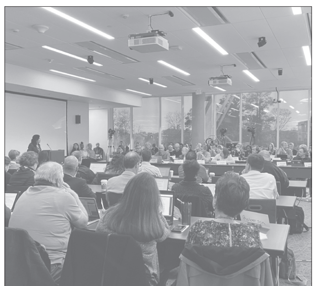
Faculty Senate reconvenes for the first meeting of the semester.

This writer can be contacted at news@theeastcarolinian.com.