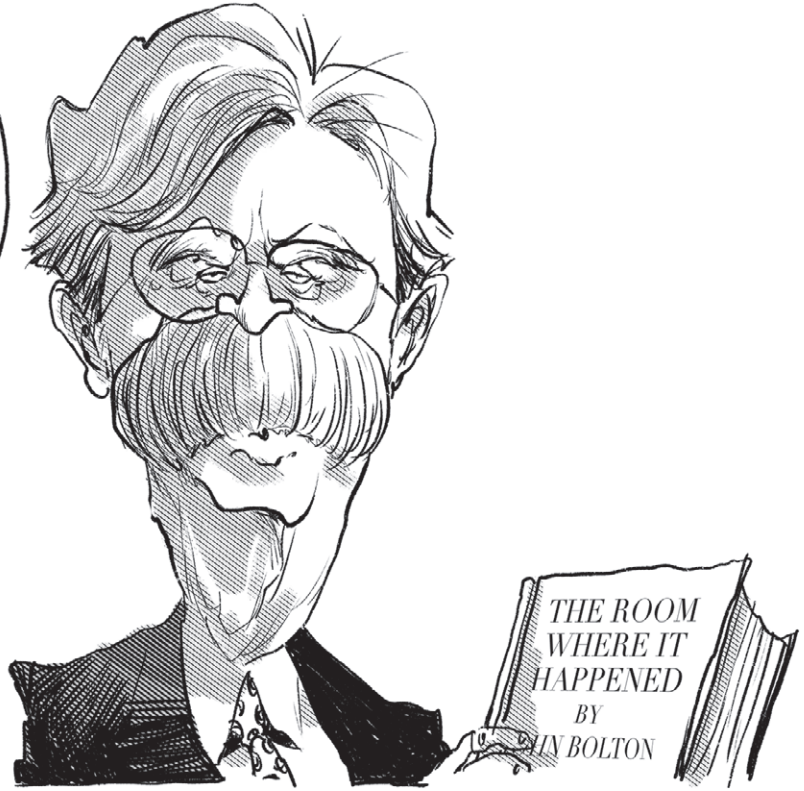
THE OTHER QUID PRO QUO