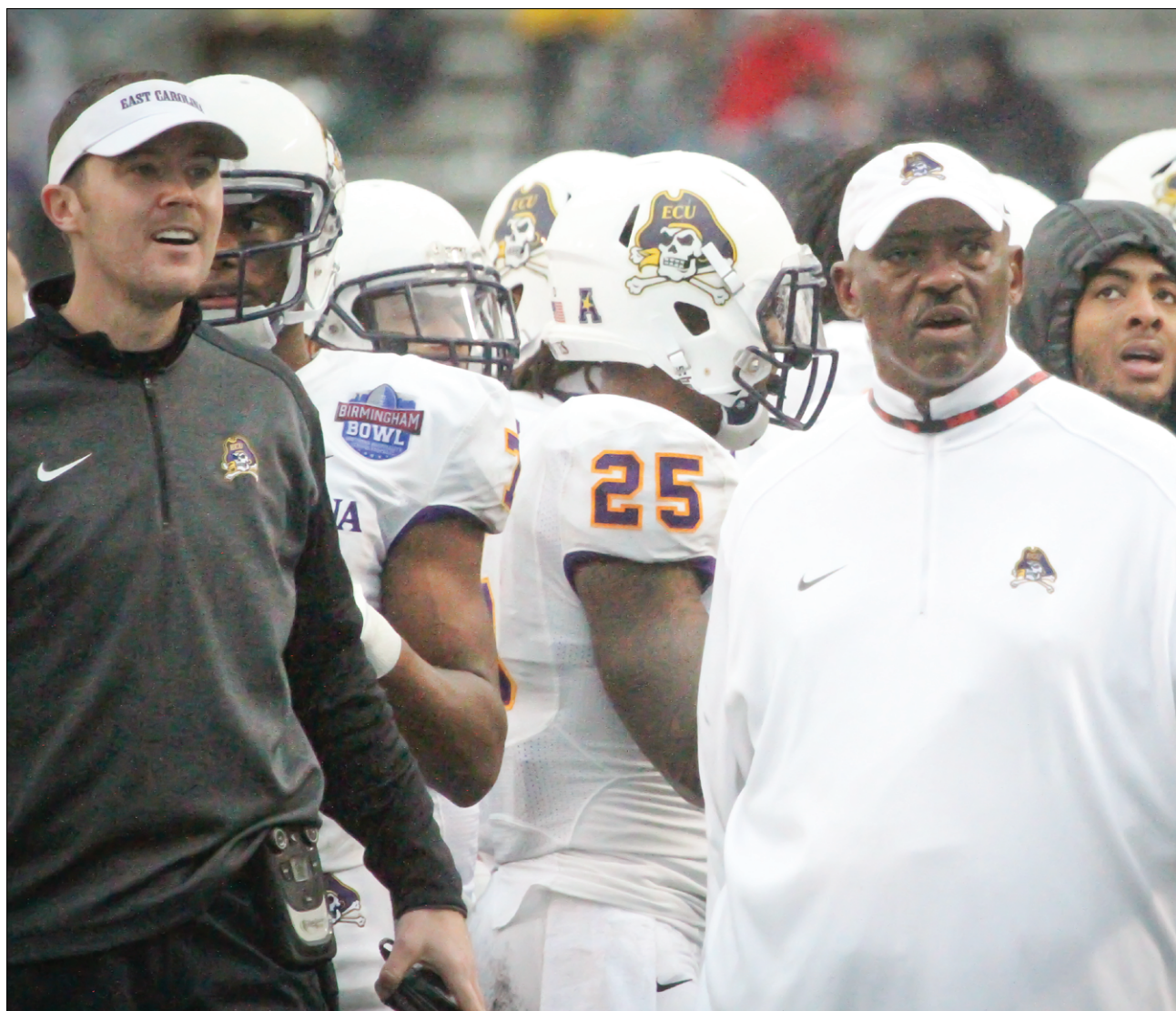
ARCHIVED | THE EAST CAROLINIAN