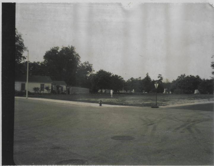
PHOTOGRAPH FROM HERE