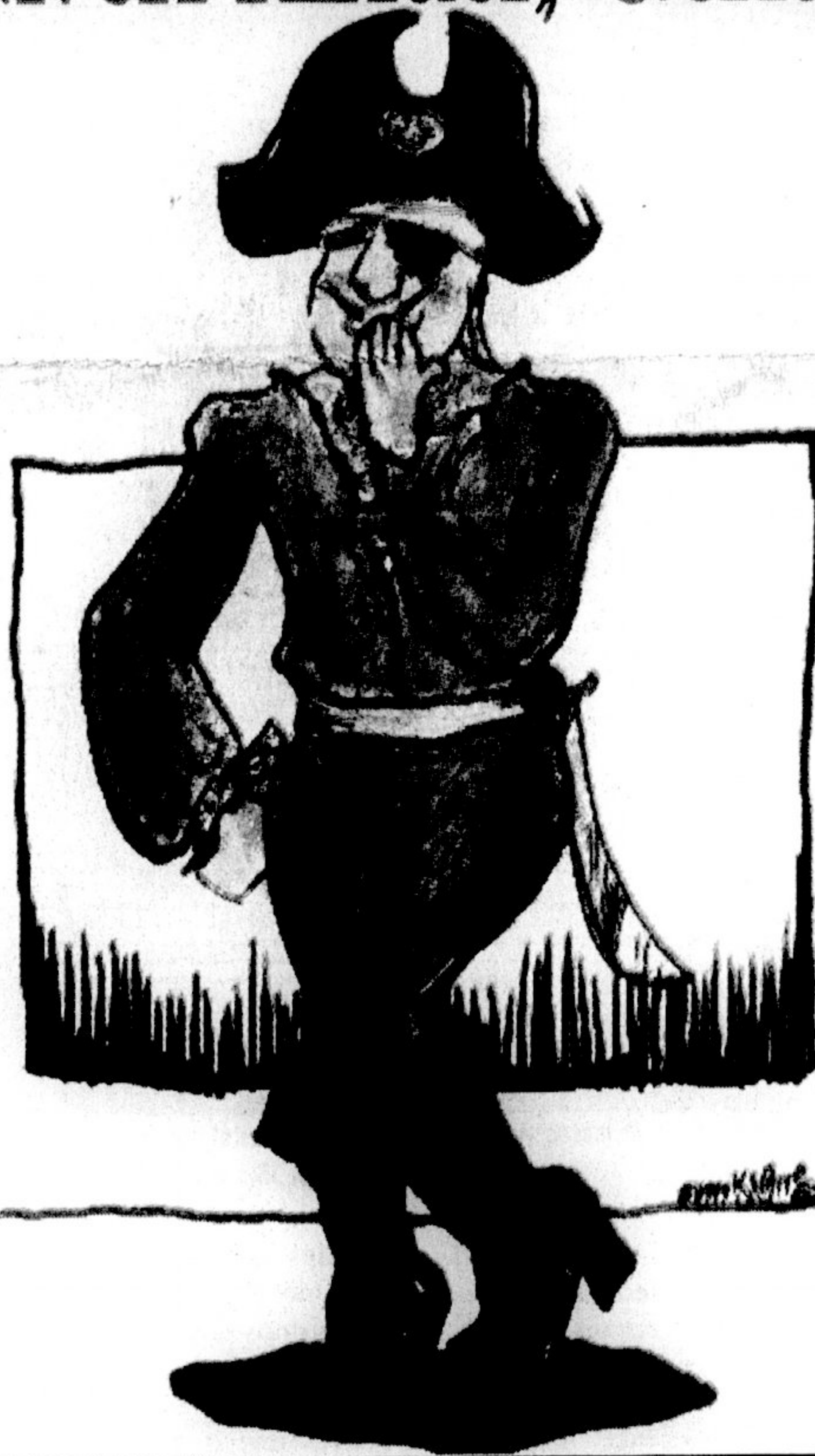
The Board of Regents announced the new kinder, gentler Pirate in response to this year's testosterone charged image.

After a strenuous semester of dieting and exercising in the Minges training room, Petey proudly displayed his slimmer, trimmer, more muscular physique to the world a year ago.