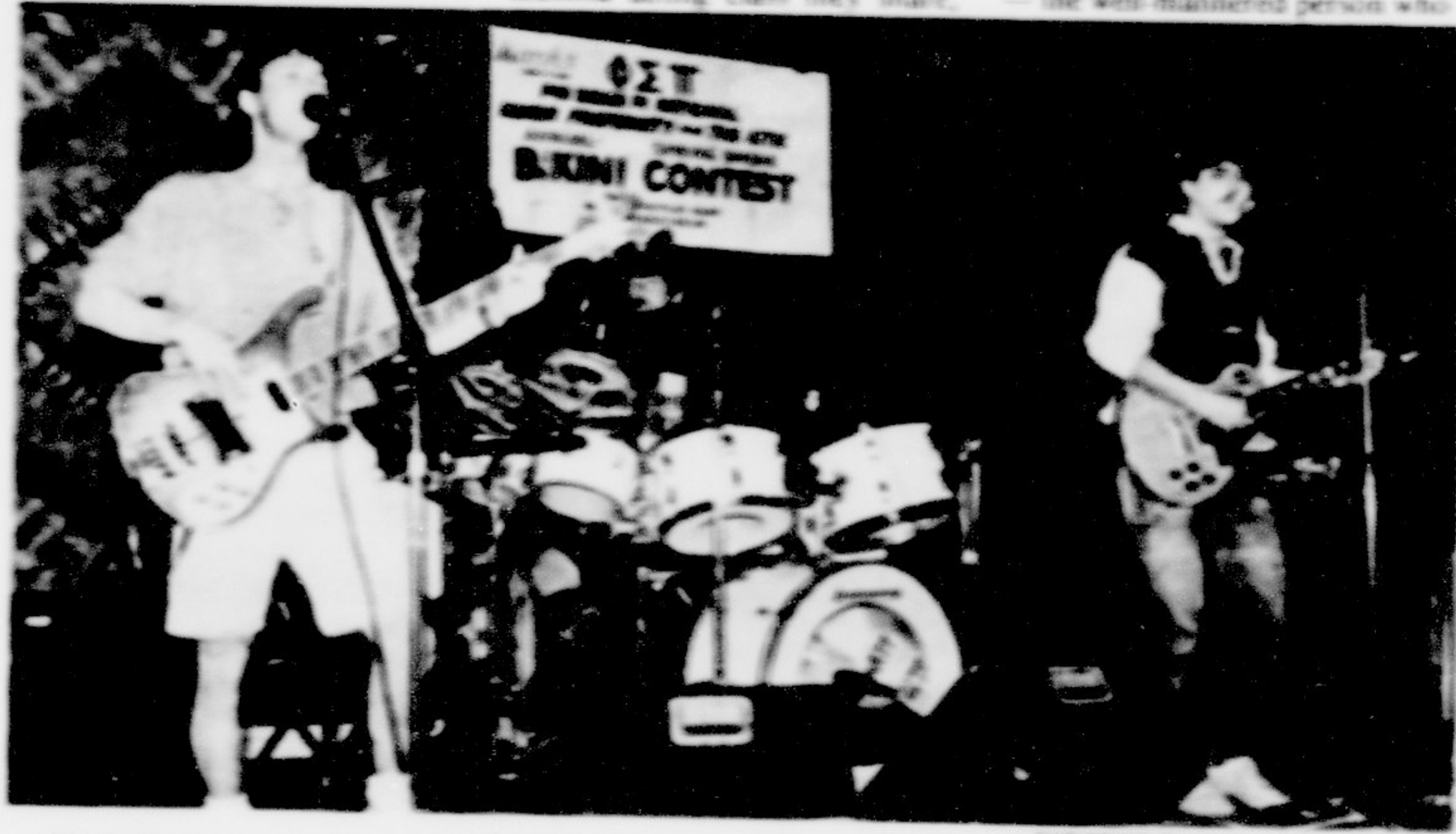
The Moody Dudes are an up-and-coming band of local students with a passion for music. After their debut at the Underground, they have been playing in several local bars, including the Attic, as pictured.