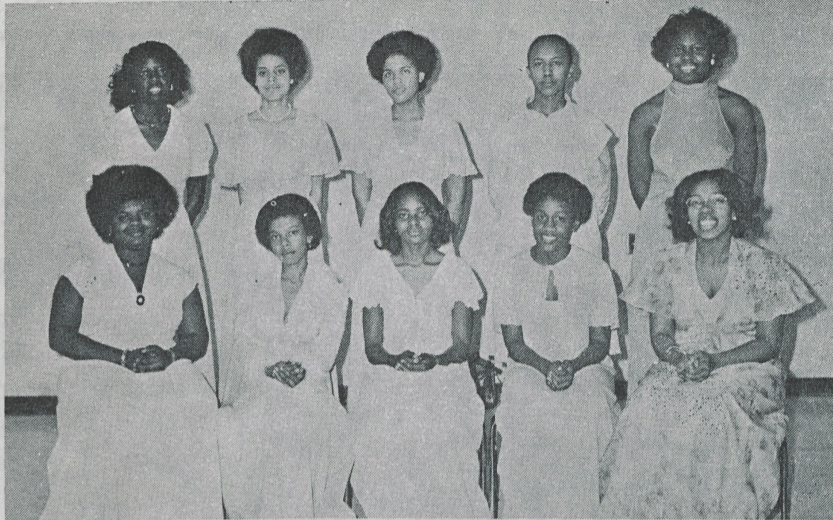
CONTESTANTS for "Miss College Bound, 1977"