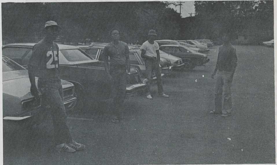
QUIET ECSTASY II