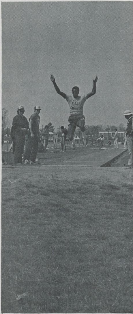
PIRATES compete in long jump.

The Pirates mile relay team was in an exciting race to the finish, with the local taking third behind Howard and Delaware State, winding up a super day of track competition.