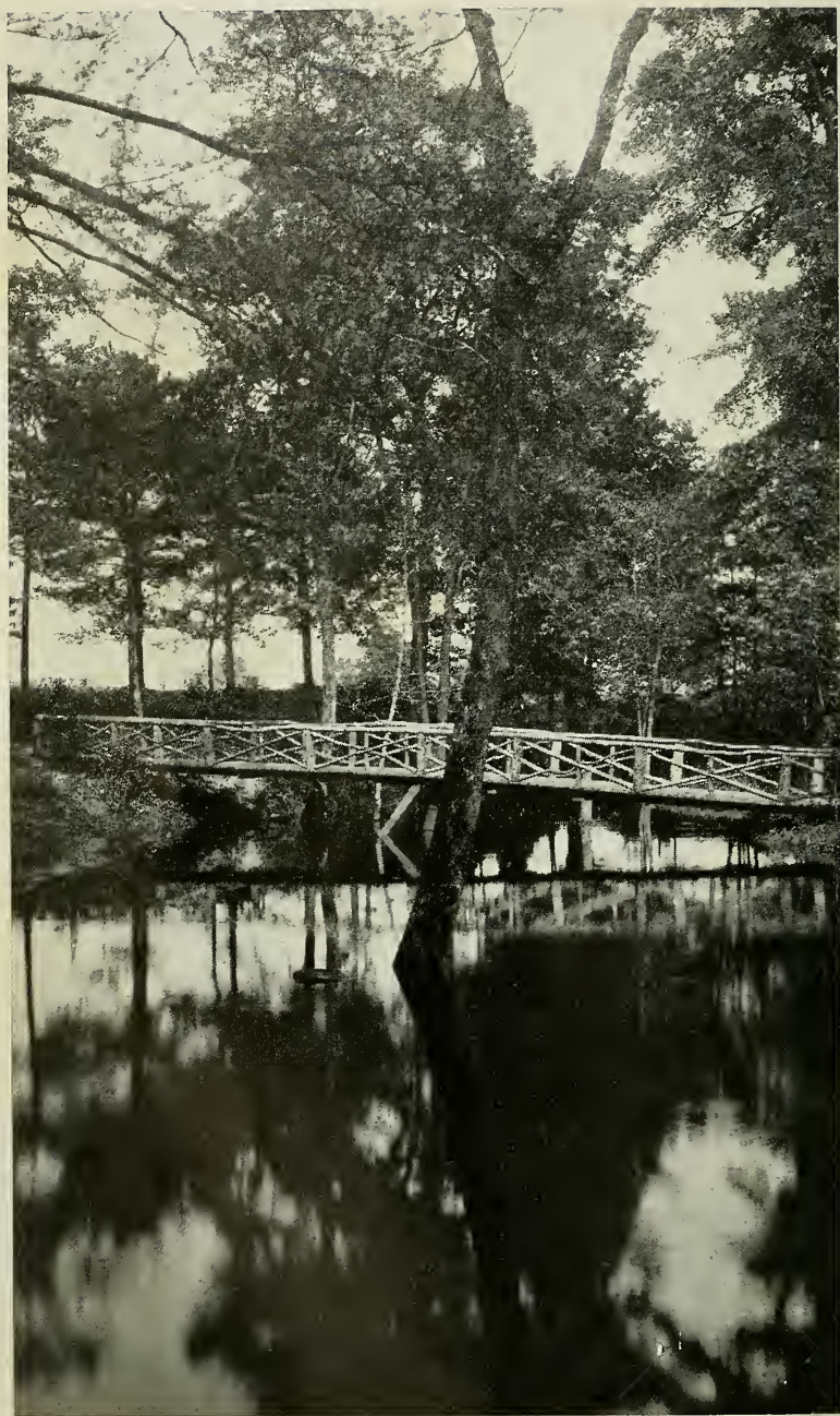
THE LAKE—EAST CAMPUS