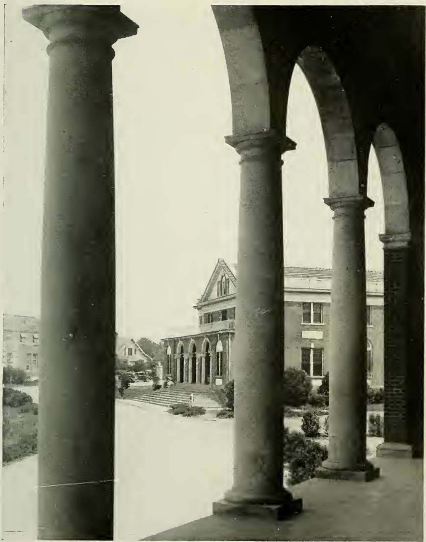
COLUMNS OF THE WRIGHT BUILDING