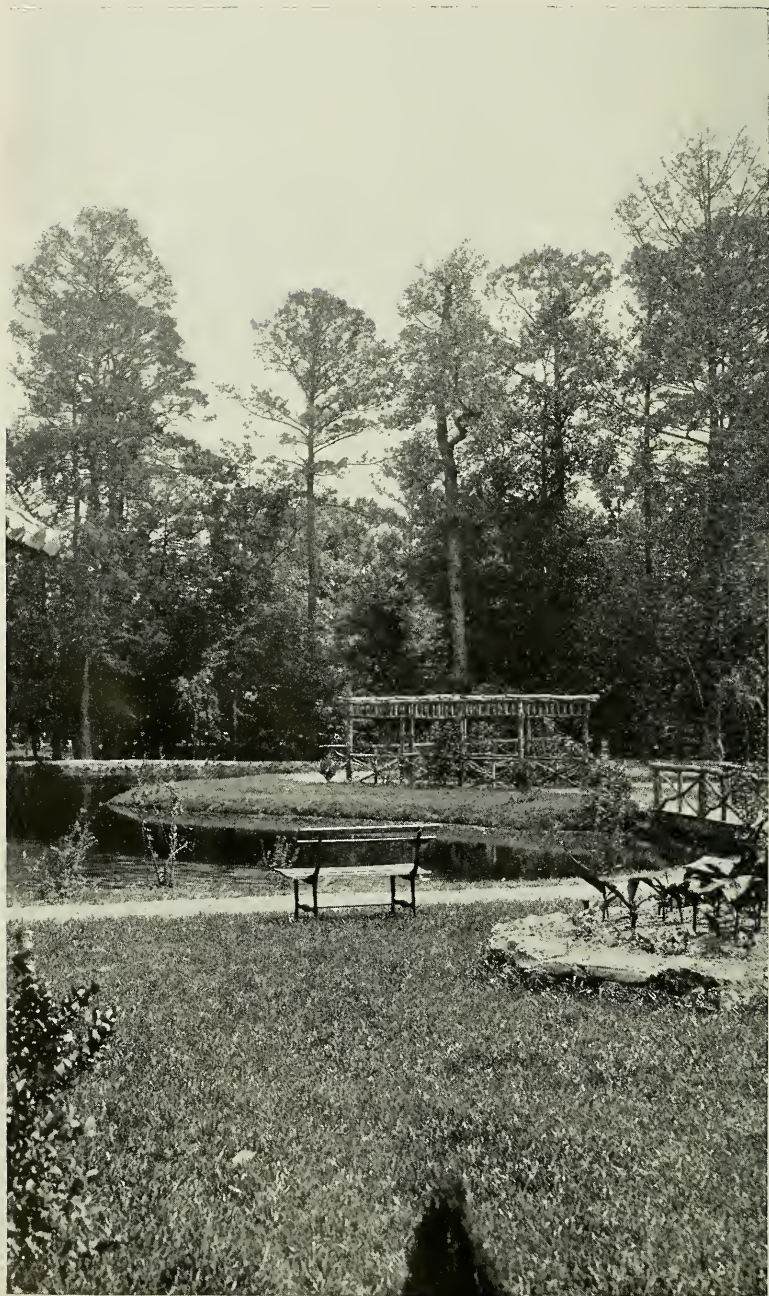
LAKE SCENE—EAST CAMPUS