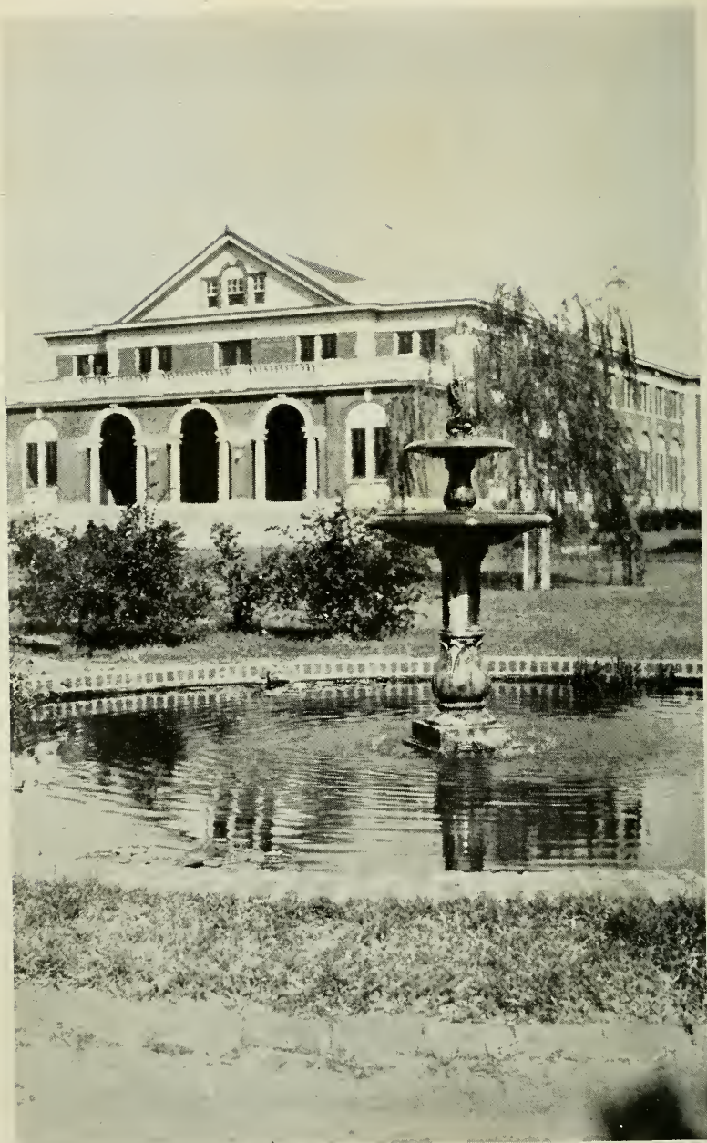
LIBRARY ACROSS WRIGHT CIRCLE