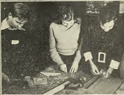
ART METAL WORK