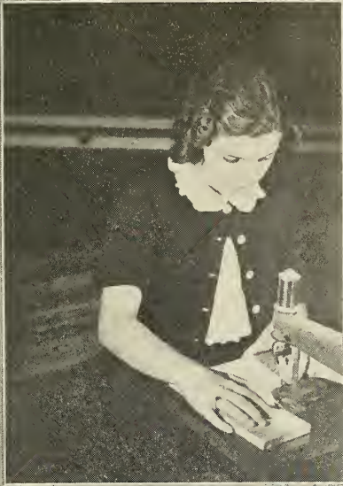
USING THE JIG SAW