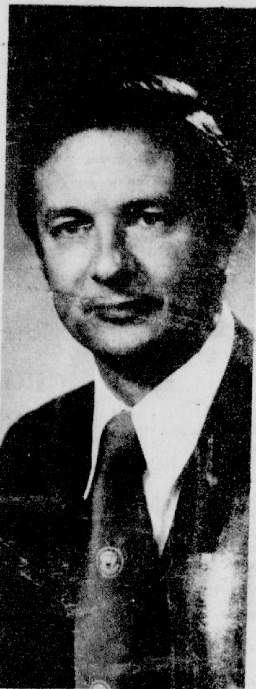
JIM HUNT, candidate for governor, will speak at 7 p.m. August 12

Hunt, a native of Wilson, is married to the former Carolyn Leonard of Mingo, Iowa, and