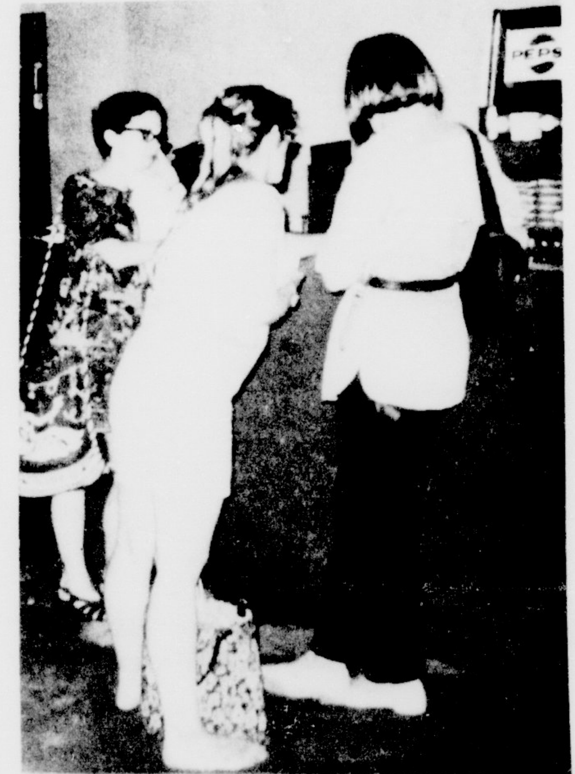
LIBERATION WOMEN BREAK for lunch at statewide Women's Liberation Conference in Fayetteville, N.C.

After a wedding trip to Chocowinity, the couple will make their home in Greenville.