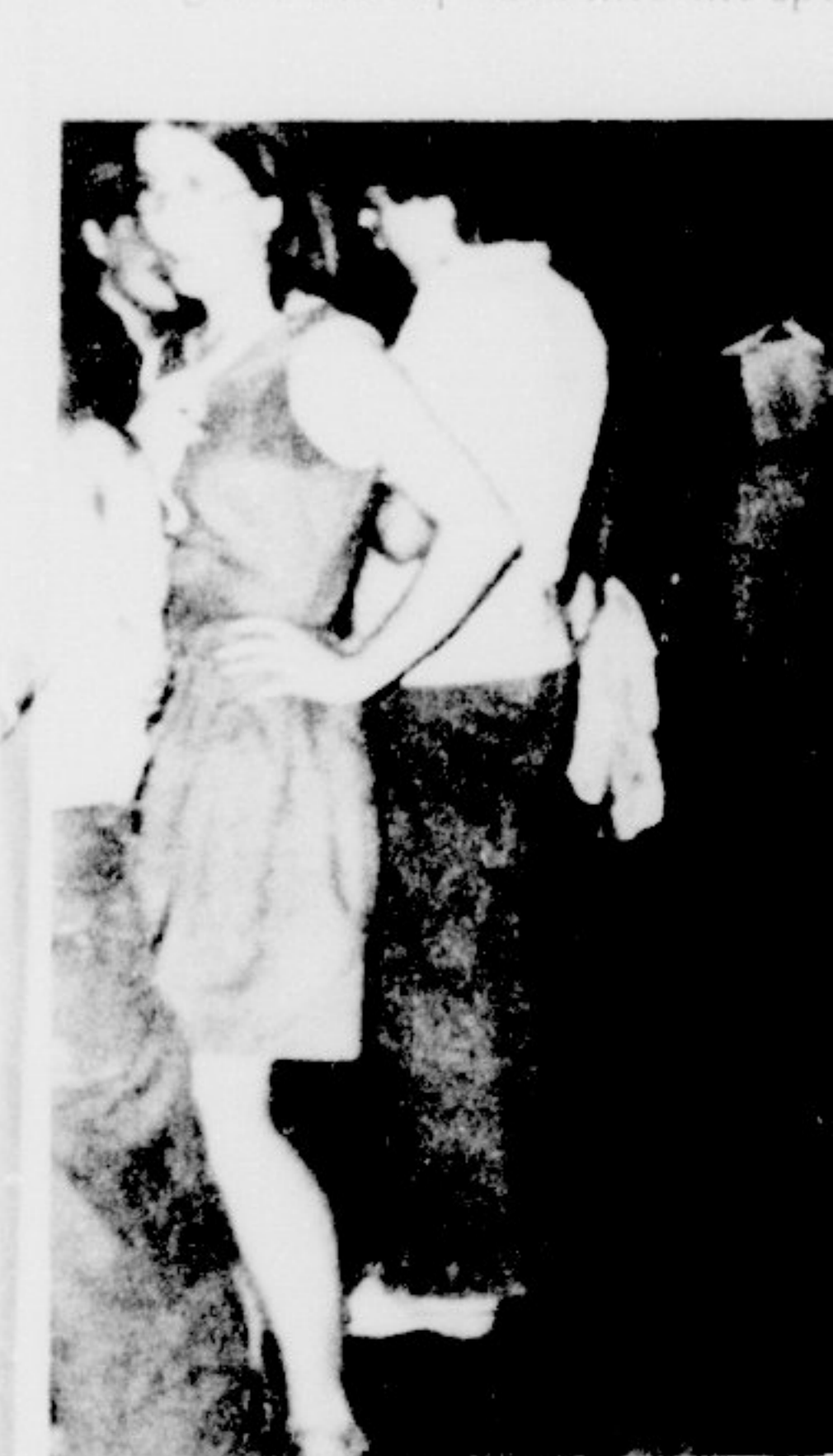
EXHAUSTED WOMEN DIVING for lunch break at the first state conference at Haymarket Square. The women of the organization and browse over the numerous