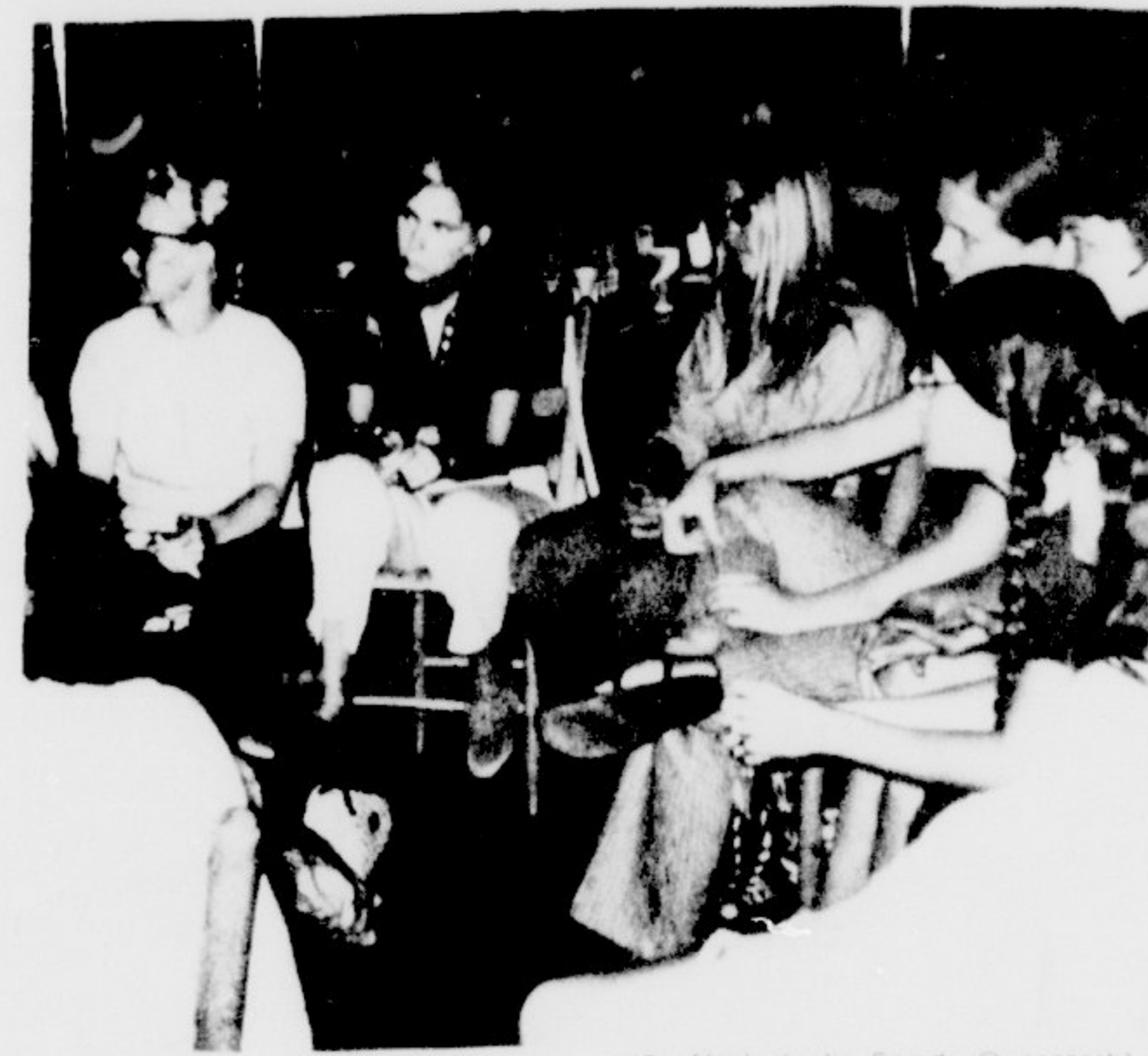
HOT AND TIRED, Liberation women strain to hear.

Included was the following comment from Loma Linda Medical School: "The qualitative level of medical education and medical practice is significantly below that in the United States, and in other areas of endeavor are more challenging to ambitious, energetic and intellectually capable young men."