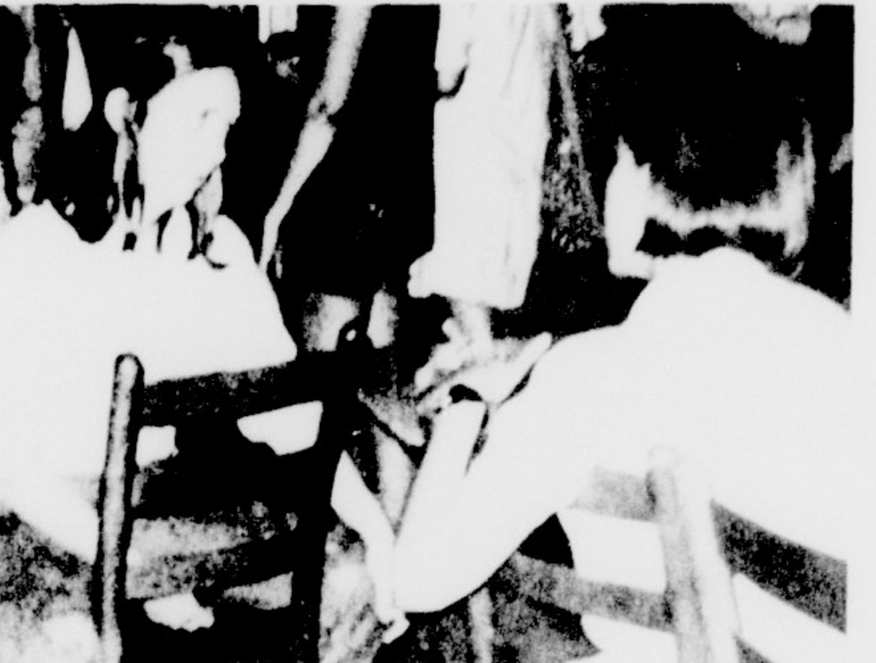
TWO LIB WOMEN discuss progress in their cities.

Women have enough influence over human affairs without being politicians. A woman is nobody. A wife is everything. A pretty girl is equal to 10,000 men, and a mother is next to God. Females should resolve to maintain their rights as wives, belles, virgins, and mothers, and not as women. Wifehood is the crowning glory of a woman. Loving submission is woman's characteristic. Men lean most to justice, and women to mercy. Politics degrade women. Women are not losing their femininity—men are becoming effeminate.