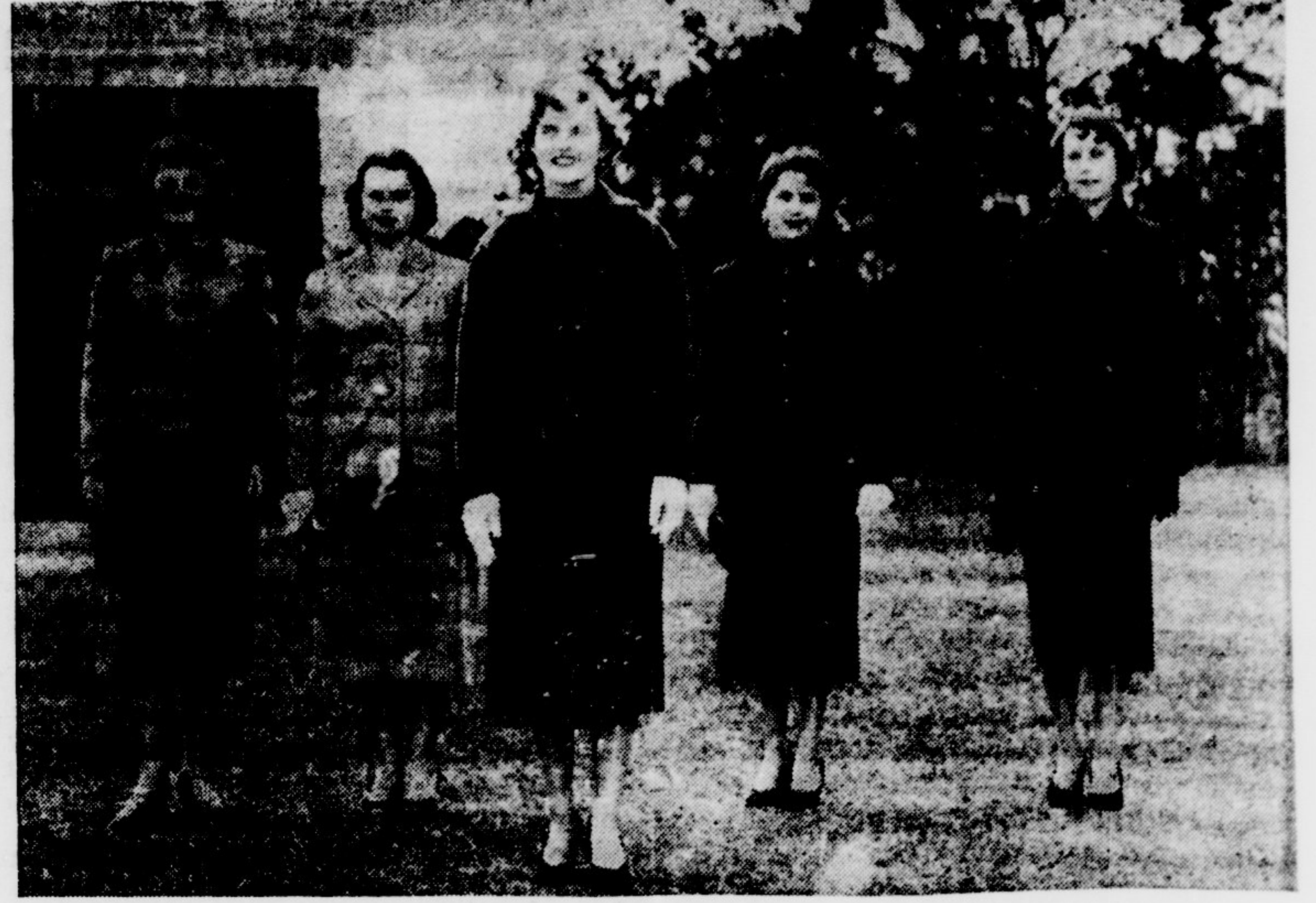
Shown above are the official representative and cadet group sponsors of the college AFROT. These girls take part in all programs requiring hostesses for the campus Air Force group.