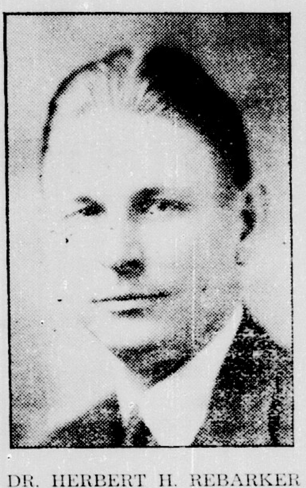
Dean of Men