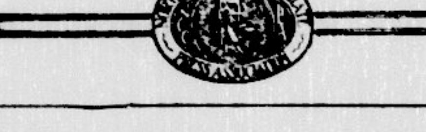
Wednesday, Sept. 27, 1933.

Advertising Rates 25c per column inch per issue