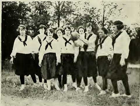
1—CAPTAINS OF TEAMS