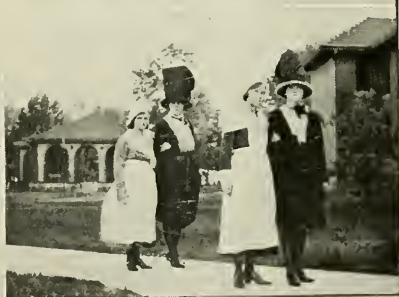
1, 2—PLANTING THE CLASS TREE