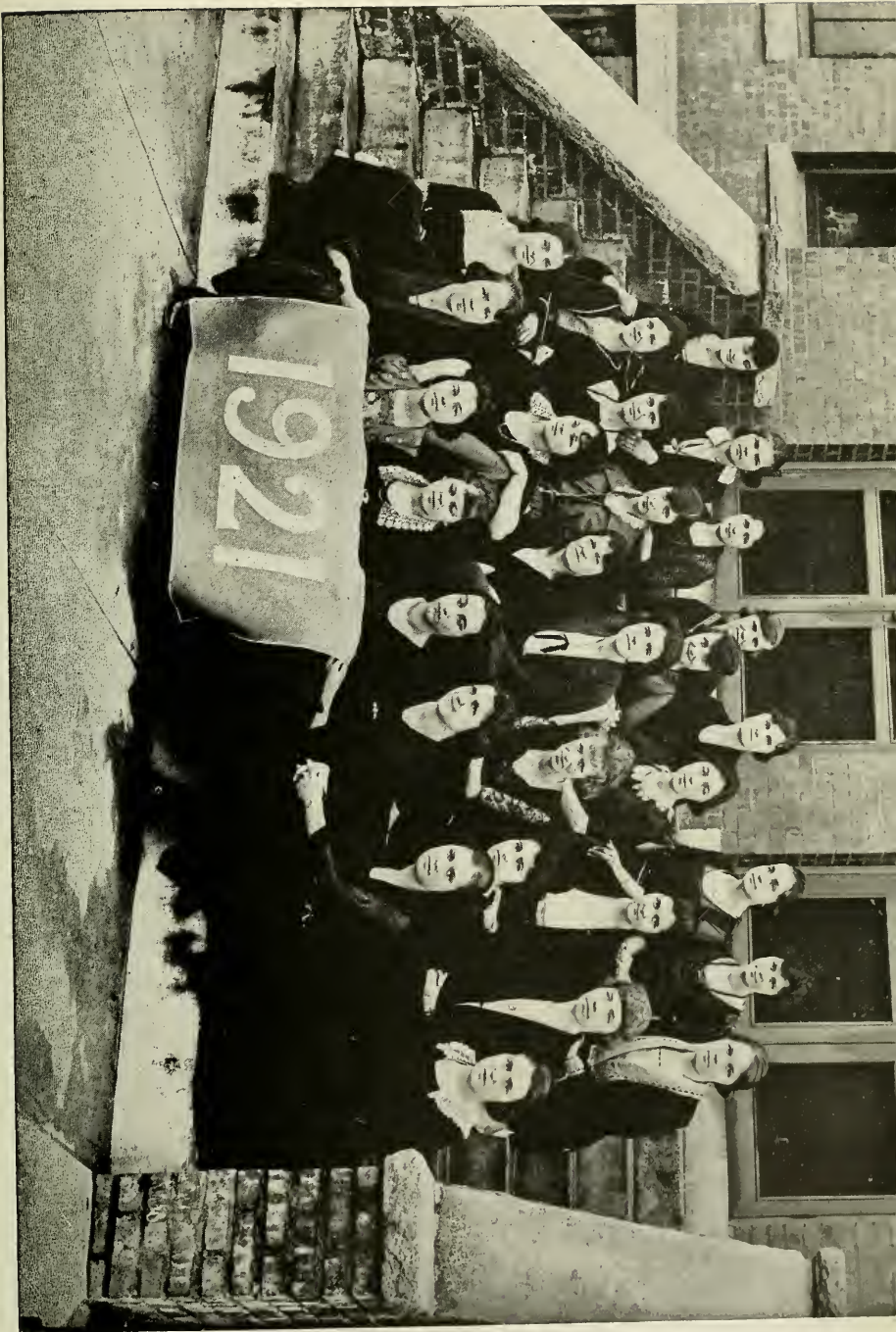
Row 1—3, 40, 15, 27, 24, 28, 23 Row 2—17, 10, 81, 58, 39, 41