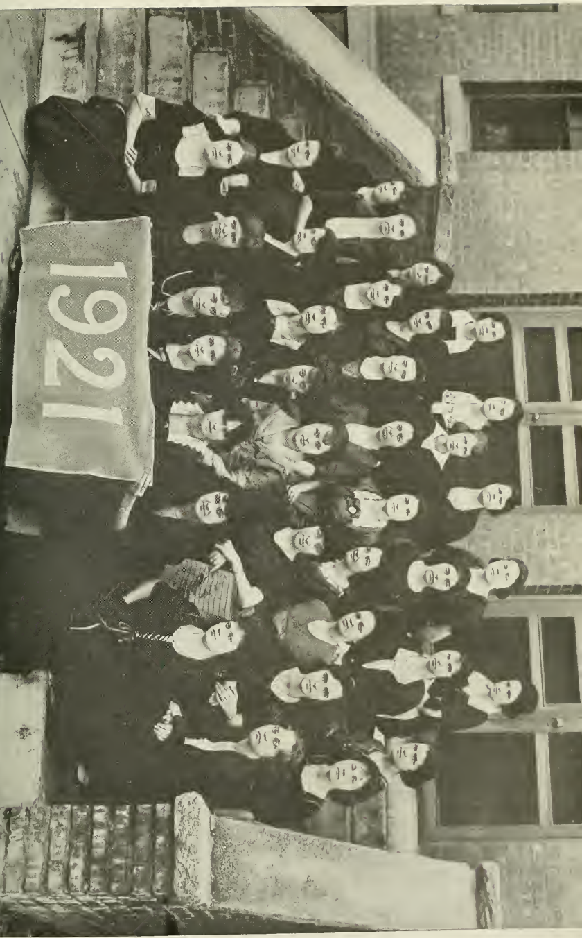
Row 1—18, 16, 30, 20, 15, 46, 19 Row 2—9, 7, 1, 35, 36, 42, 22, 8, Row 3—33, 21, 29, 32, 51, 48, 43, 34, 12 Row 4—5, 13, 37, 52, 41, 14 Row 5—31, 47, 49, 50, 2