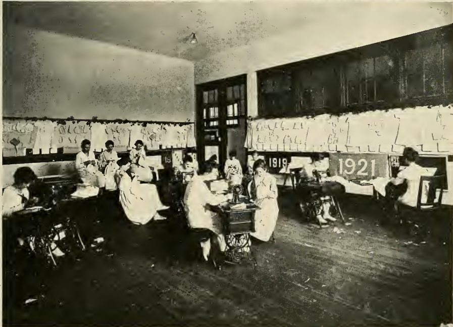
RED CROSS WORKROOM Layettes for the Belgian Babies