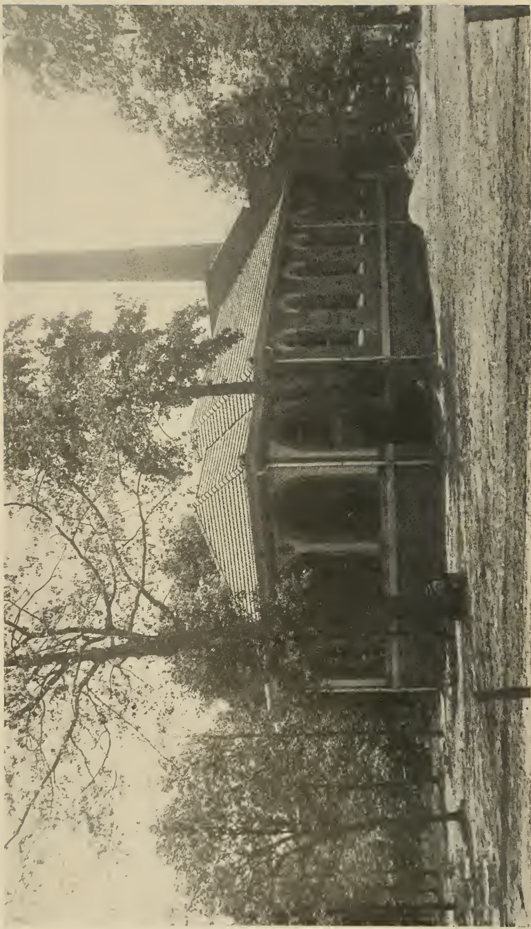
THE SCHOOL POWER PLANT AND LAUNDRY