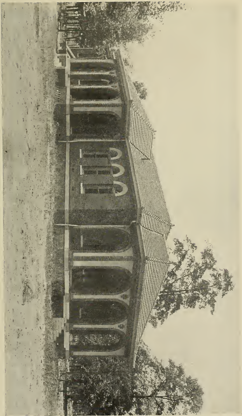
THE SCHOOL INFIRMARY