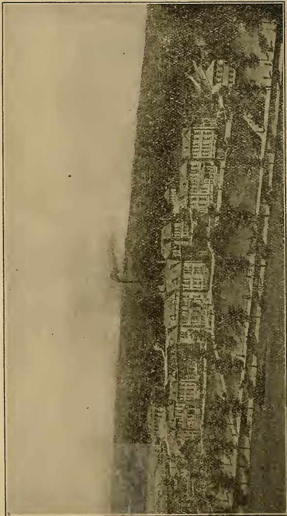
Gymnasium (To be erected) Power House Dining Hall Infirmary Library (To be erected) President's Residence (To be erected) Dormitory Administration Building Dormitory EAST CAROLINA TEACHERS TRAINING SCHOOL, GREENVILLE, N. C.