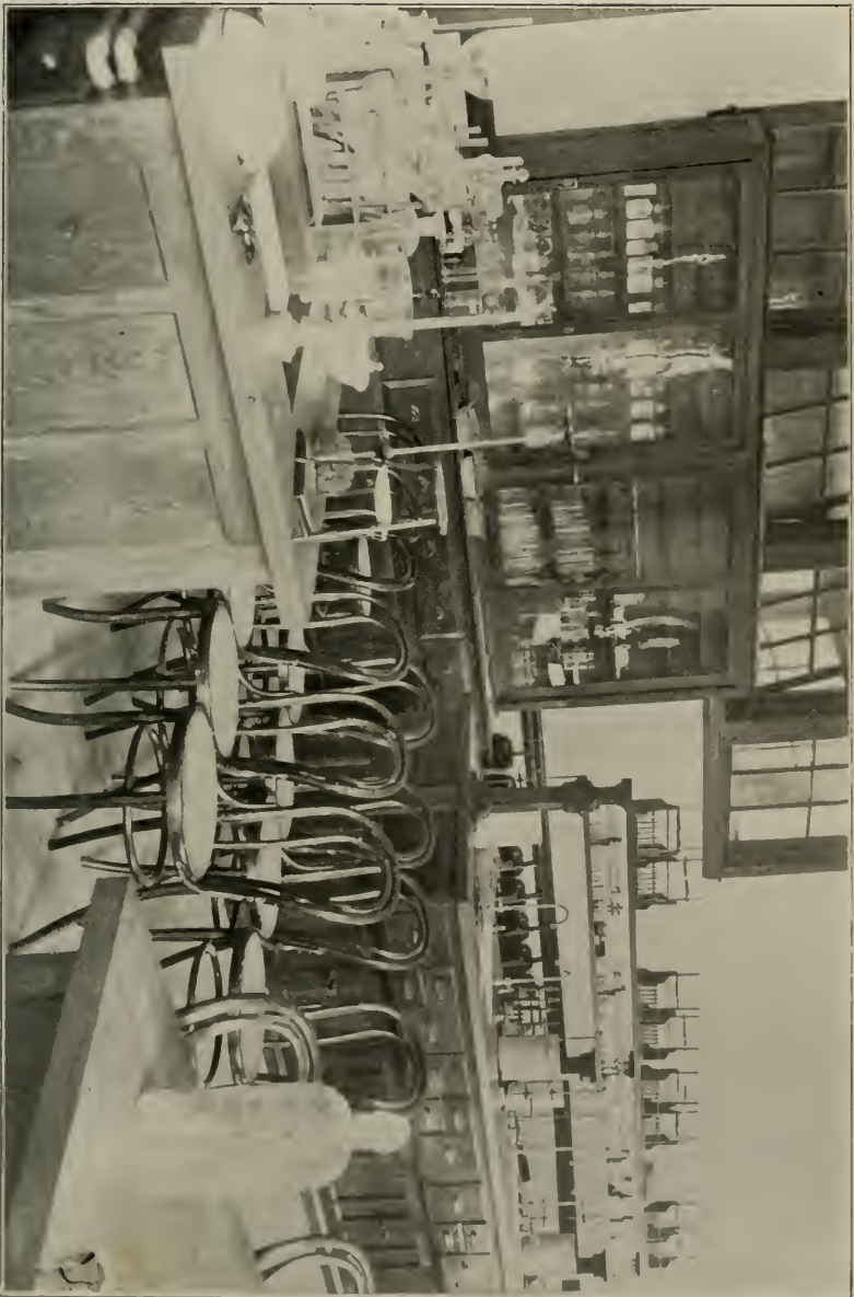
A SECTION OF THE LABORATORY