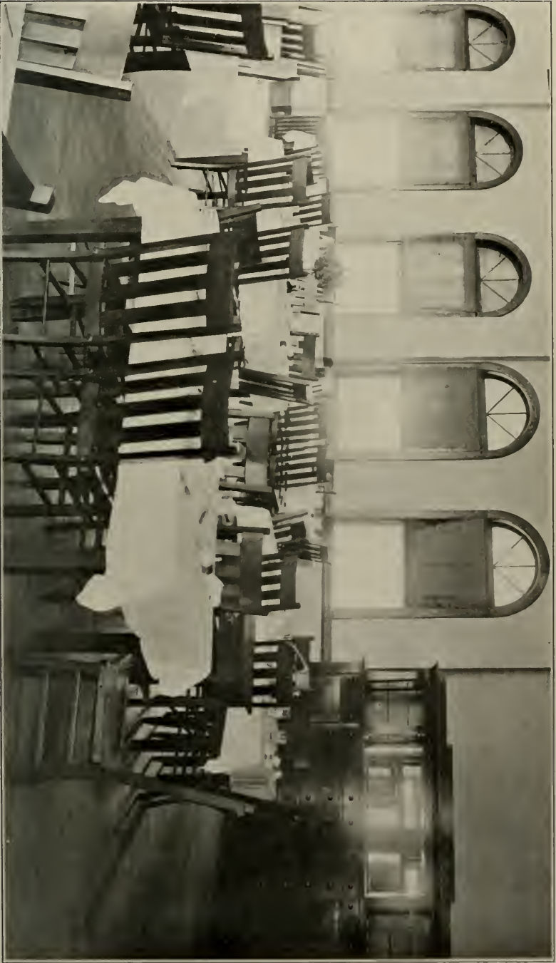
A CORNER OF THE DINING-ROOM